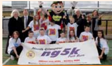
ng5k 2010 was launched at our first Mini 2K at Milton Pitches

The 5th Anniversary North Glasgow 'ng5k' Fun Run took place on Sunday April 25th in Ruchill Park attracting a record breaking 2,900 participants. Thousands of fun runners of all ages and abilities took part in 'Superhero' themed fancy costumes to celebrate the occasion. The introduction of 'Early Bird' registration increased target numbers of local residents taking part with 70% of ng5k participants having a North Glasgow postcode. Despite increasing the capacity of the event by 300 this year, registration was closed 6 weeks early due to the overwhelming demand from local people wanting to take part. In the lead up to the main 5K event in April, ng5k Steering Group partners delivered a series of 'Mini 2K Events' throughout March for over 1,500 pupils from 25 North Glasgow Primary and SEN schools. ng5k continues to offer FREE entry for all and remains one of the biggest events of its kind in Glasgow.