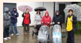
Big Fit Walk Week

Community Champion' award in North Glasgow for 'Health & Wellbeing' in December. Steering Group members, walk leaders, and walkers attended the award ceremony at Maryhill Fire Station.