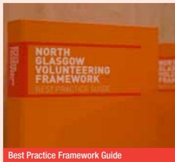
Best Practice Framework Guide

Following its successful pilot, the North Glasgow Volunteering Activity Group (led by North Glasgow HLC) engaged with over 100 local 'hard to reach' residents in a 7 step 'Volunteering Tasters Programme'. Taster opportunities this year included community gardening, charity administration and customer services, and volunteering at a local library. In addition, 20 previous participants were 'tracked' as a follow up to last year's programme, and have since moved on to other volunteering roles, education, training and employment opportunities. Local organisations were also introduced to the 'Best Practice Framework Guide' produced by the VAG with the aim of building and adopting an Action Plan. All were supported through a series of workshops and distance learning via e-support through North Glasgow HLC's website. Organisations involved in best practice action planning last year put their plans into action to ensure better support for volunteers within their organisation during 2010/11.