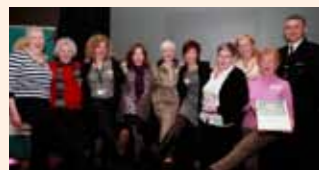
NSM members with their award

Following on from the success of the Northern Sole Mates Walking Network, Steering Group members furthered plans to develop Jogging and Buggy Groups this year. North Glasgow HLC funded Jog Leader training for volunteers to set up 5 new groups for local joggers and sourced a local trainer to deliver Buggy Exercise. This programme is due to commence at the start of summer 2011. The on-going success of the Walking Network saw 427 walks with 3,017 attendances throughout 2010/11. Walkers also participated in network and city wide events and initiatives including the Big Fit Walk Week. 'Map Packs' of walks in the local area will be ready for distribution in the summer with the aim to promote independent walking. Northern Sole Mates was also awarded the 'Evening Times